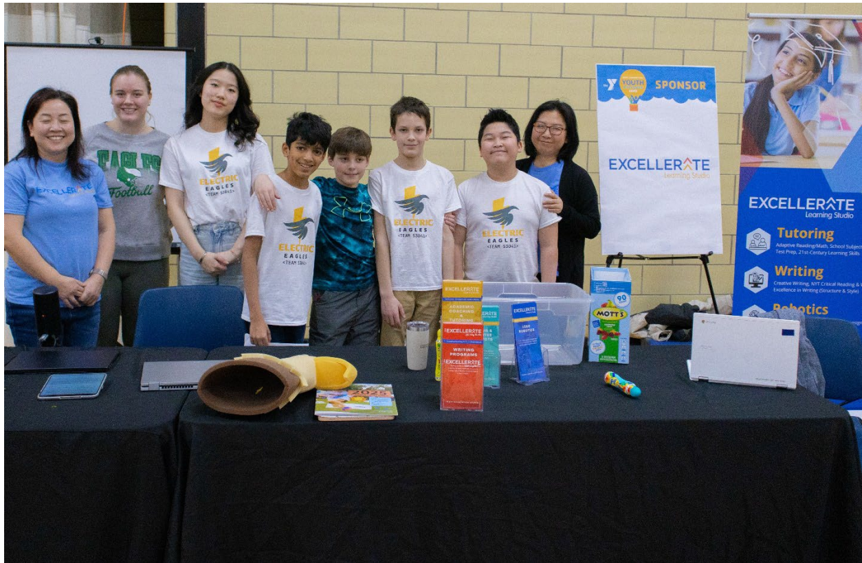
The Electric Eagles Robotics team from Excellerate Learning Studio proudly pose together at the NSYMCA Youth Explorer Expo Event on January 12.