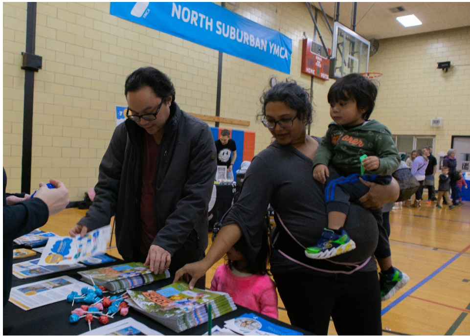
Over 100 families attend the NSYMCA Youth Explorer Expo on January 12 th in Northbrook.