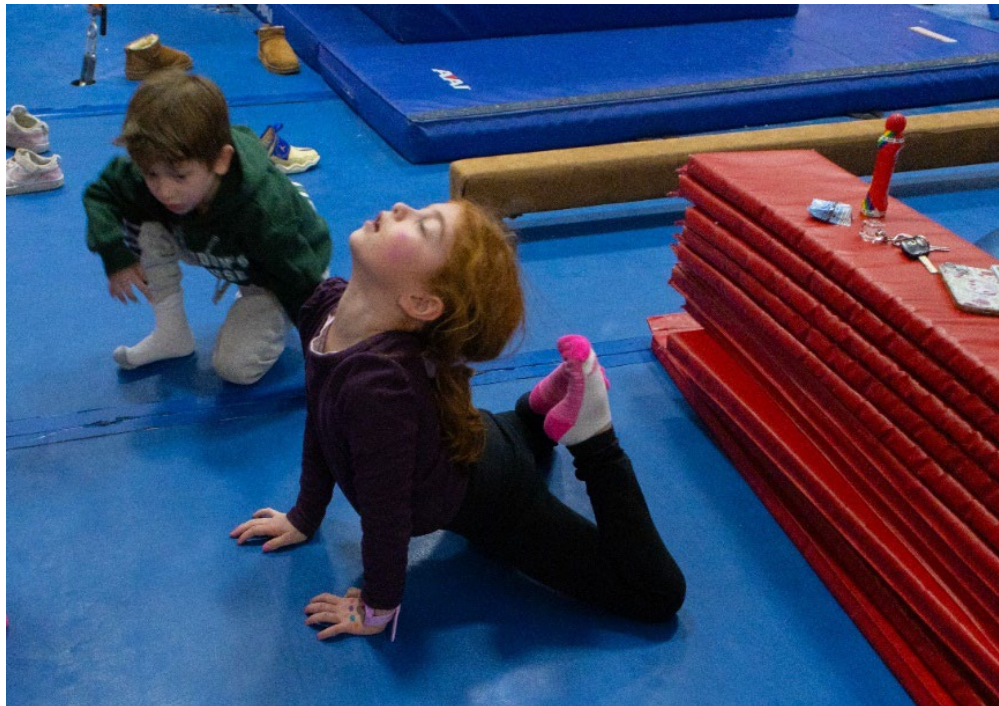
Children get a chance to use the gymnastics equipment while exploring the event at the NSYMCA Youth Explorer Expo on Sunday, January 12.