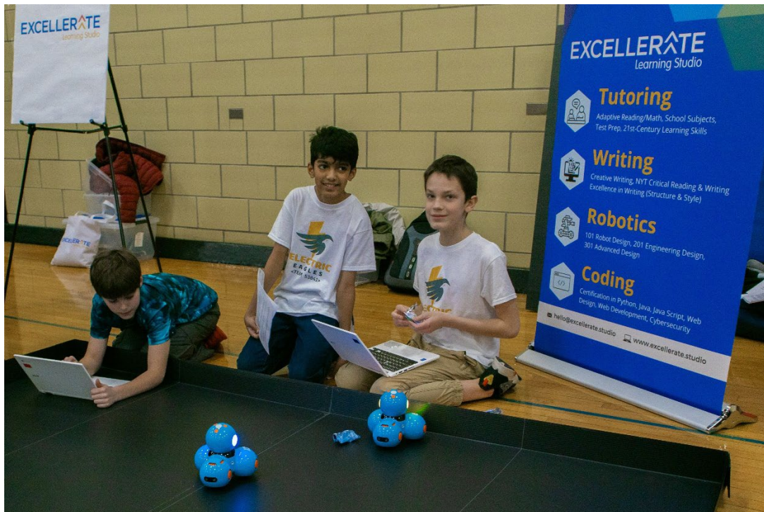
The Electric Eagles Robotics team from Excellerate Learning Studio showcased their robot models at the NSYMCA Youth Explorer Event in Northbrook on January 12 th .