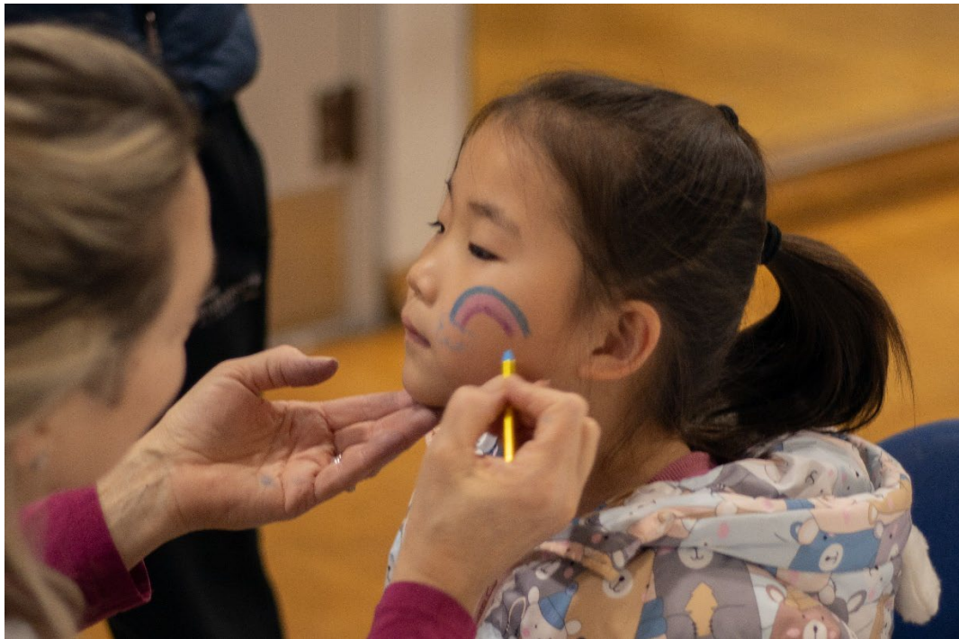
Face Painting was one of the many activities the children could enjoy at the free NSYMCA Youth Explorer Expo on January 12 th in Northbrook.