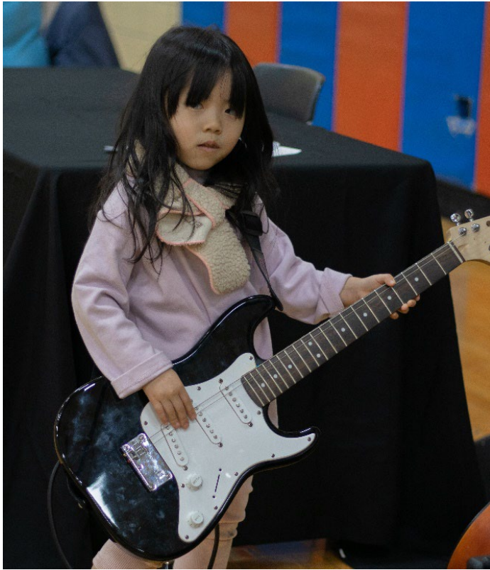
A young girl tries out an electric guitar at the School of Rock table at the NSYMCA Youth Explorer Expo on Sunday, January 12.