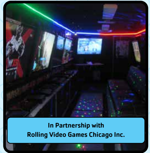
In Partnership with Rolling Video Games Chicago Inc.