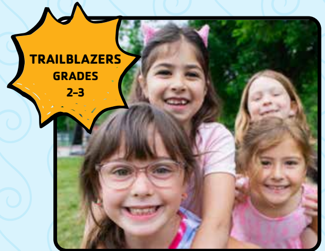
TRAILBLAZERS GRADES 2-3