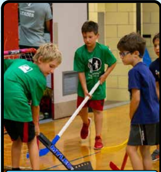
This program was supported by the Ruth Schultz Bright Days Fund