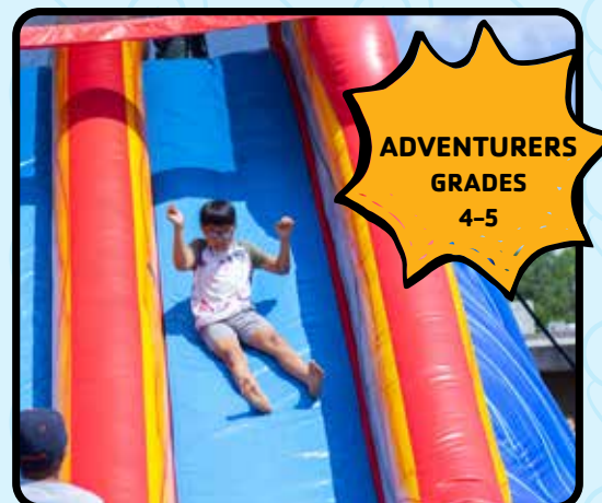
ADVENTURERS GRADES 4-5