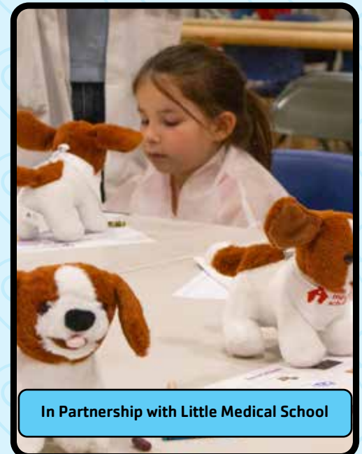
In Partnership with Little Medical School