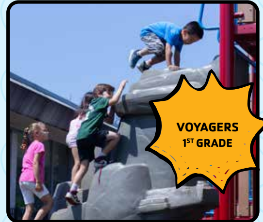
VOYAGERS 1 ST GRADE