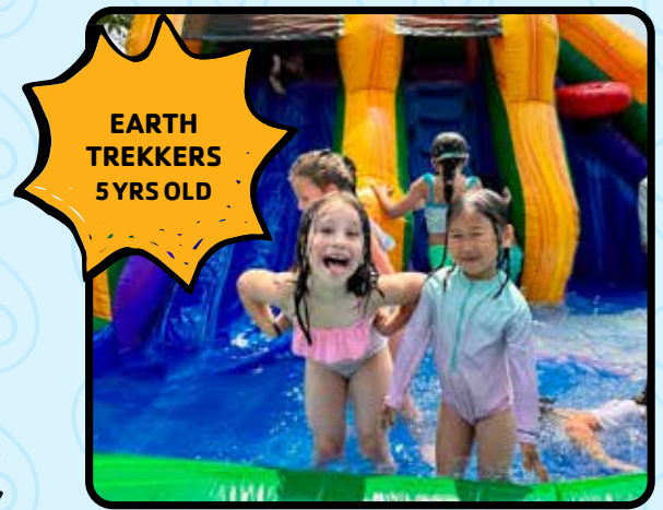
EARTH TREKKERS 5 YRS OLD