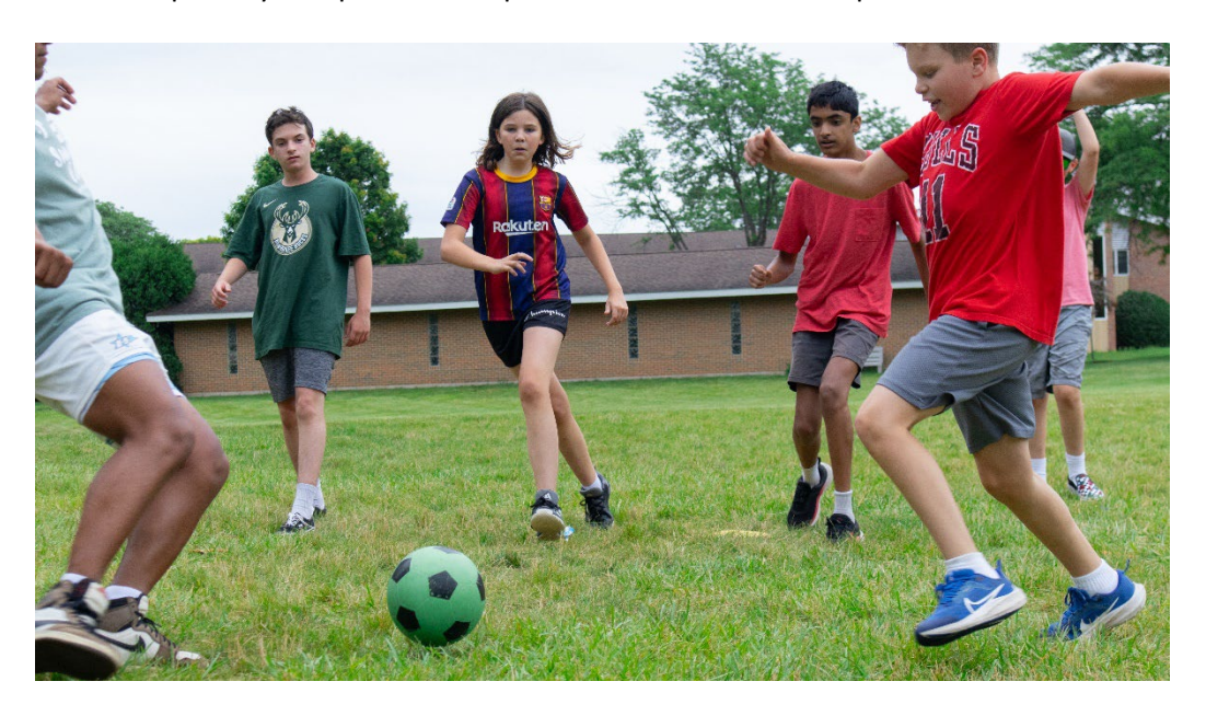
NSYMCA Classic "Sports camp" from the 2024 Session