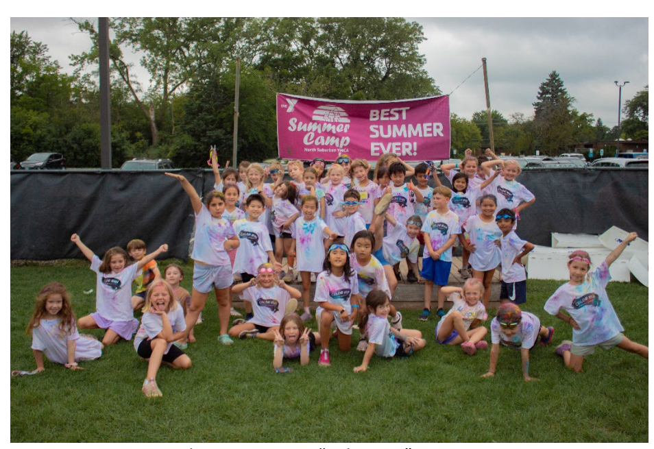
NSYMCA 2024 Camp charity program "Color Run"

The North Suburban YMCA services Northbrook and 14 surrounding communities with programs and tools that help its residents become healthier, more connected, and confident, ensuring that everyone, regardless of age, income, or background, has the opportunity to learn, grow, and thrive. The NSYMCA focuses on Youth Development, Healthy Living, and Social Responsibility and is a charitable organization, inclusive and welcoming to all in our community. Learn more at NSYMCA.org.