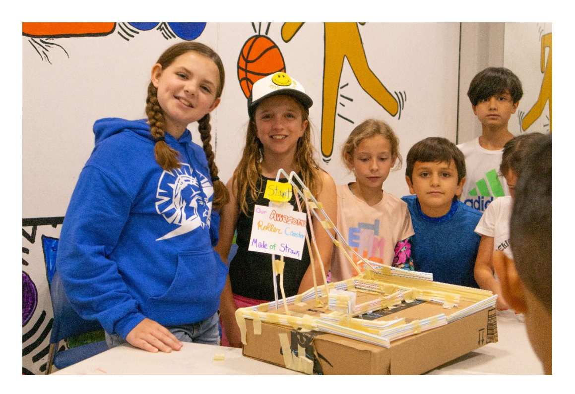
NSYMCA specialty Camp "Builders and Destroyers" from the 2024 Camp Session