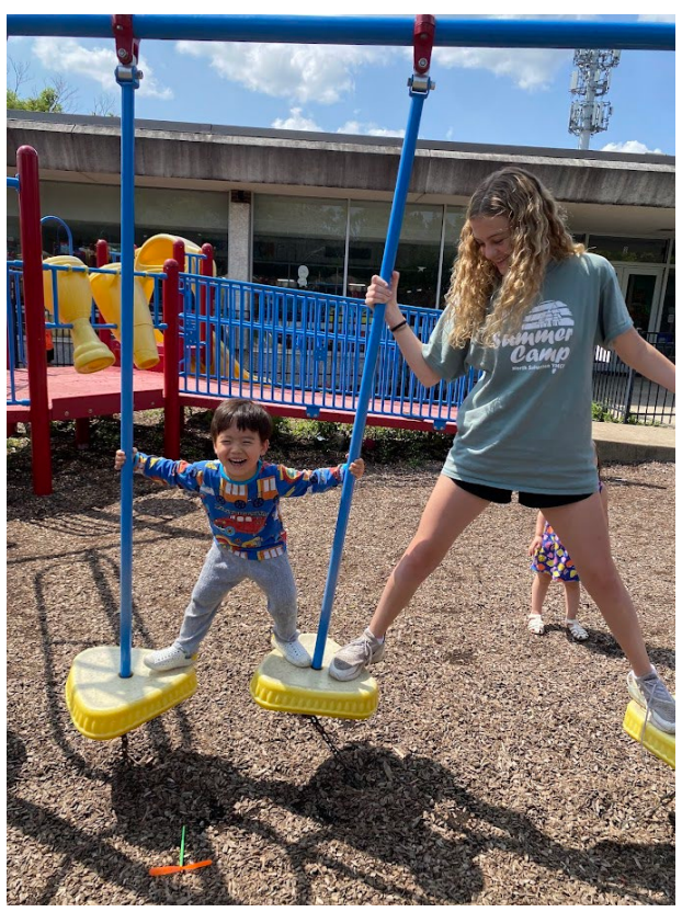
NSYMCA "Little Pioneer" Camp for the 2024 Summer Session