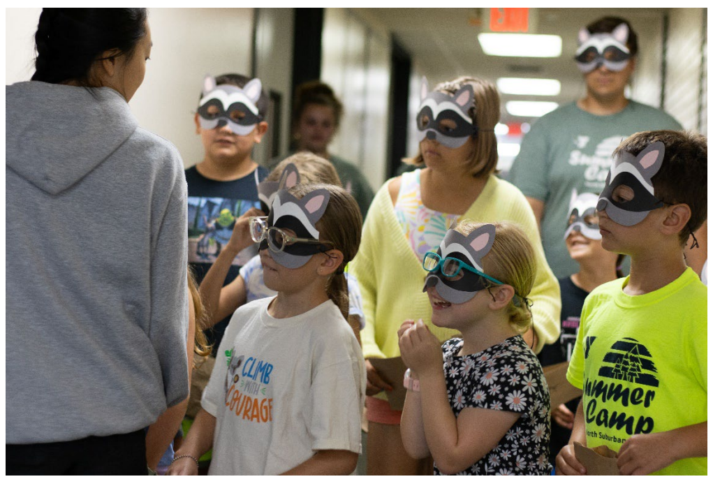
NSYMCA Specialty Camp "Nature Explorer" from the 2024 Camp Session.