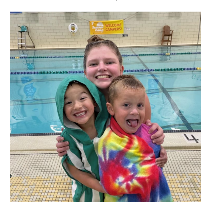
NSYMCA Swim time with the "Pathfinders" Camp Summer Session 2024