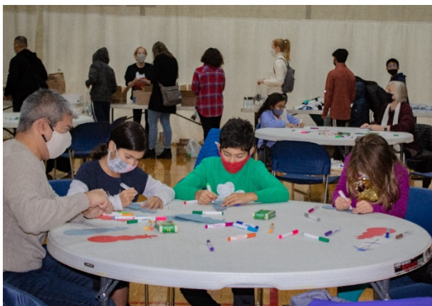
Caption: A family creating personal messages for the “Blessing Bags” at the 2021 NSYMCA Holiday Giveback event.