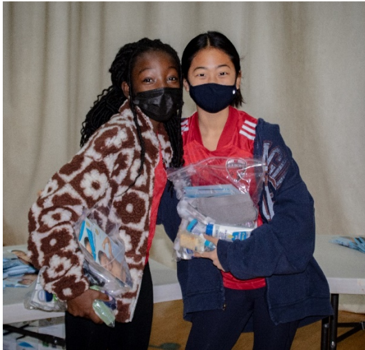
Caption: Packing “Blessing Bags” at the 2021 NSYMCA Holiday Giveback event.

The North Suburban YMCA services Northbrook and 14 surrounding communities with programs and tools that help its residents become healthier, more connected, and confident, ensuring that everyone, regardless of age, income, or background, has the opportunity to learn, grow, and thrive. The NSYMCA focuses on Youth Development, Healthy Living, and Social Responsibility and is a 501(c)3 charitable organization, inclusive and welcoming to all in our community. Learn more at NSYMCA.org .