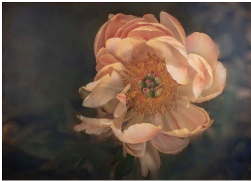
CAPTION: North Suburban YMCA's Community Gallery is showcasing the work of the Chicago Photographic Arts Society through September. Shown here is a photo by Jamie Buzil.