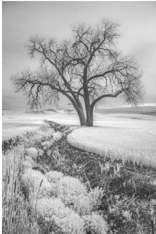
CAPTION: North Suburban YMCA's Community Gallery is showcasing the work of the Chicago Photographic Arts Society through September. Shown here is a photo by Rick Katz.