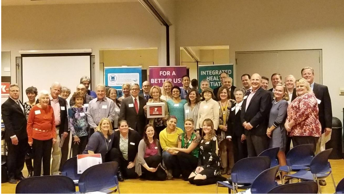
Photo Caption: Staff, volunteers, and members of the North Suburban YMCA gathered for the organization's Annual Meeting on October 11, 2018.