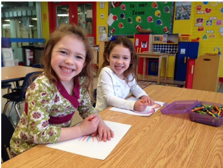
Photo Caption 1: The North Suburban YMCA’s new Preschool Education Classes will help children gain confidence, social skills, and school readiness in a caring, nurturing environment. Children will have access to the Y’s excellent facilities, including art studios, gymnasiums, and the indoor swimming pool.